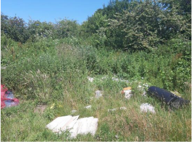
Plate 3: Dense Scrub with Dumped Debris