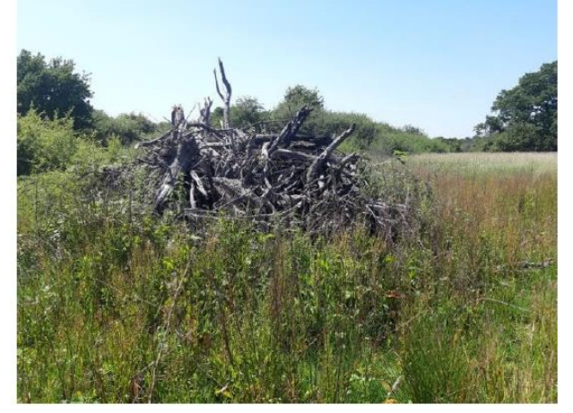
Plate 1: Scrubby Areas of Semi-improved Grassland with Log Piles