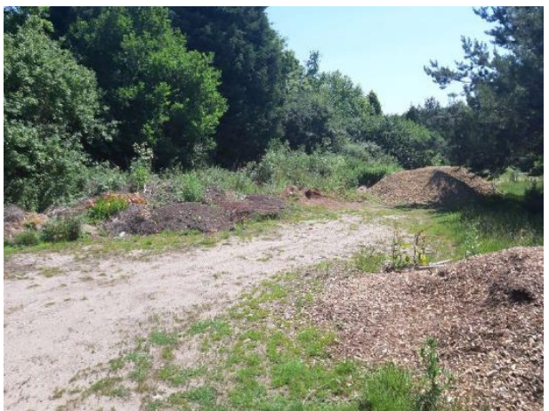
Plate 4: Access Track with Aggregate Piles