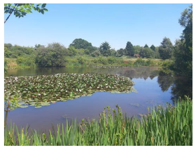
Plate 2: Large Pond in the Northern Area of the Site