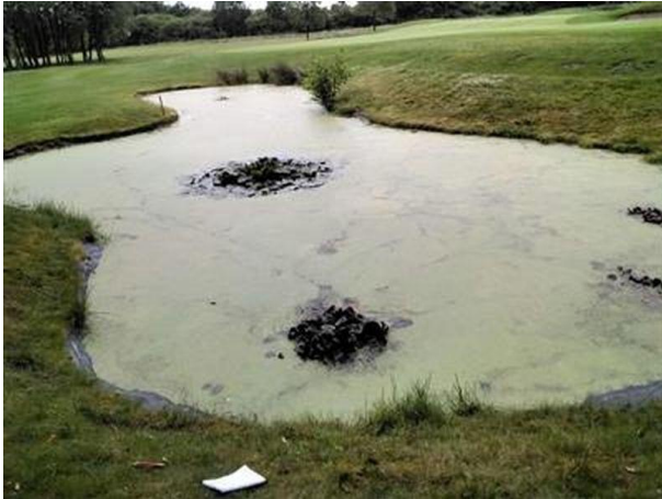
Plate 8.1: Pond P1 (on site)