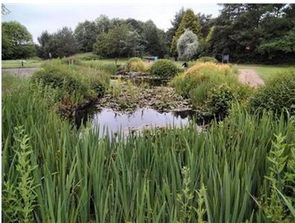
Plate 8.5: Pond P6