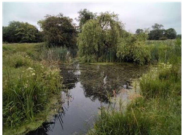
Plate 8.10: Pond P18