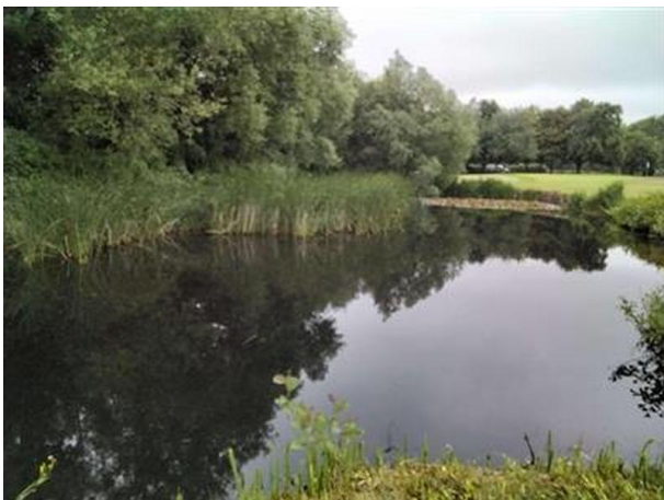
Plate 8.11: Pond P19