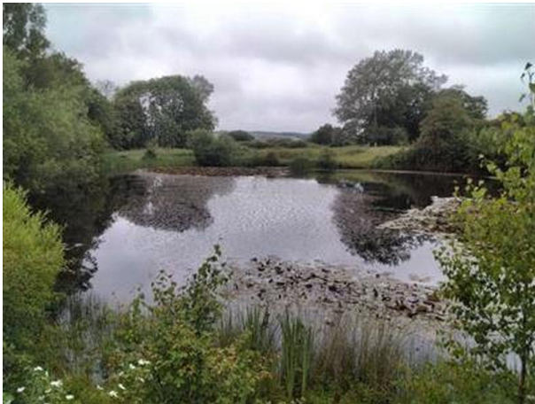
Plate 8.3: Pond P3 (on site)