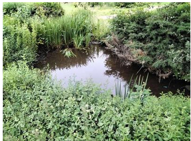
Plate 8.6: Pond P7