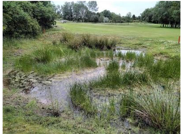
Plate 8.4: Pond P4 (on site)