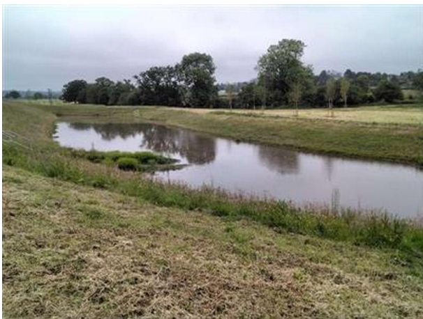
Plate 8.9: Pond P15