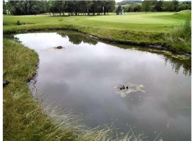
Plate 8.2: Pond P2 (on site)