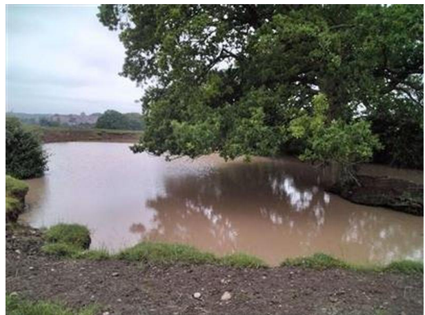
Plate 8.12: Pond P20