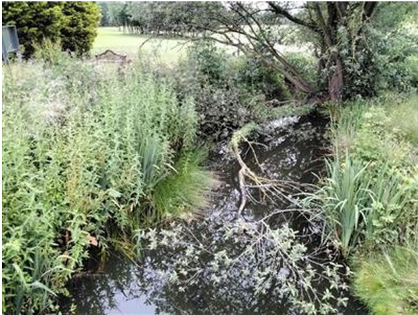
Plate 8.7: Pond P8