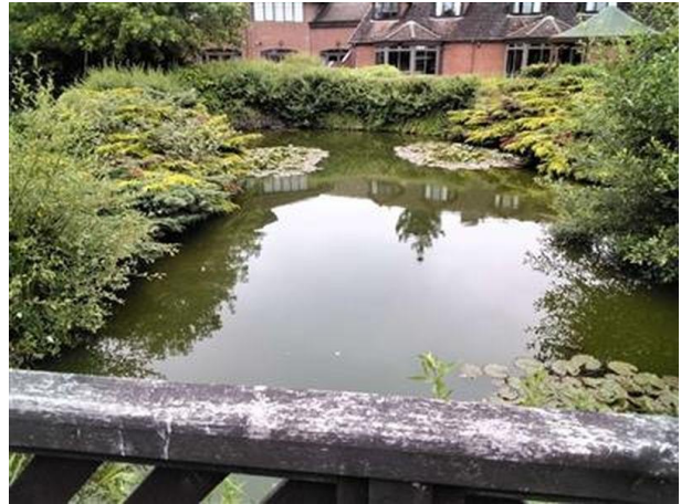
Plate 8.8: Pond P9