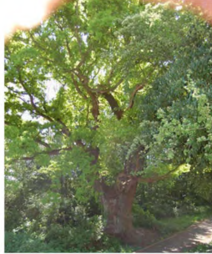
Plates 1 and 2. Veteran trees in Churchill housing estate.