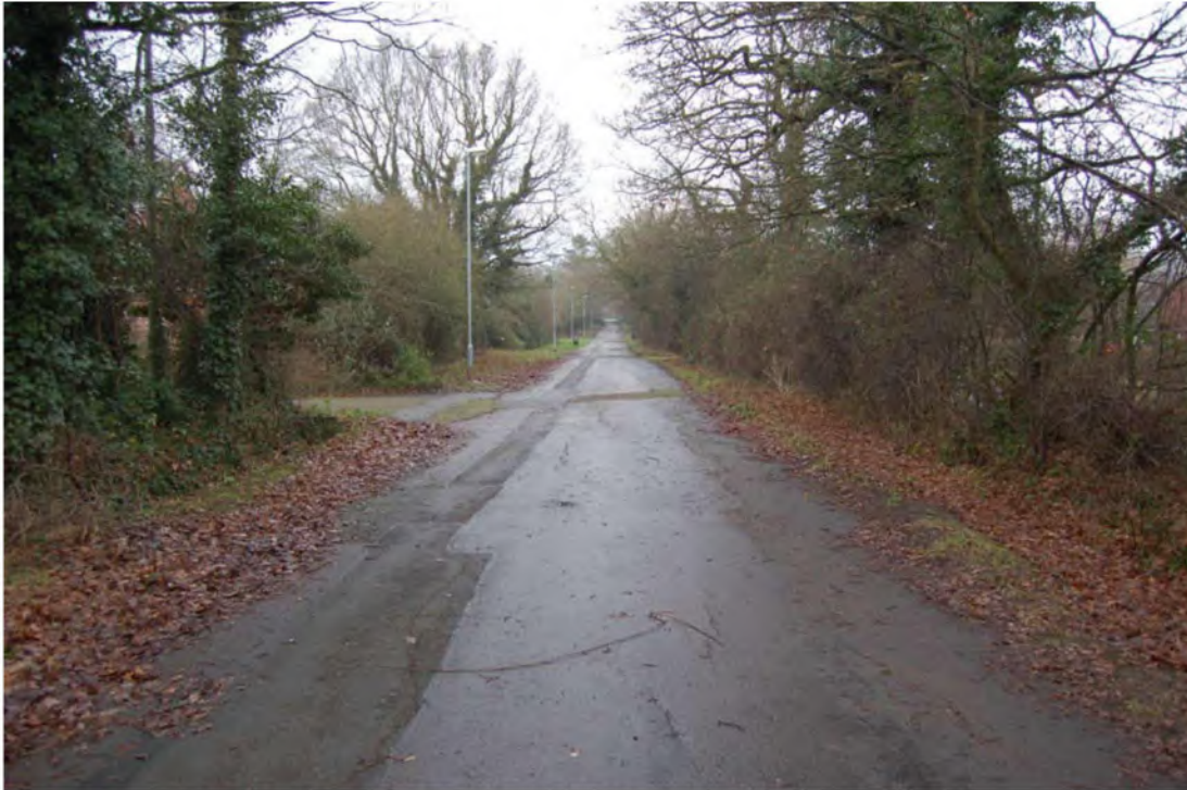
Plate 4. The Roman Rykneild Street.