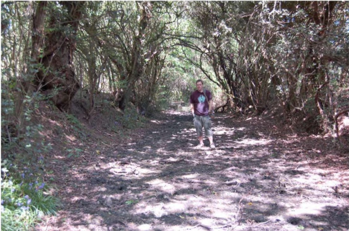
Plate 3. An archaeologist standing in the hollow way that runs along the edge of Moon's Moat Industrial Estate.