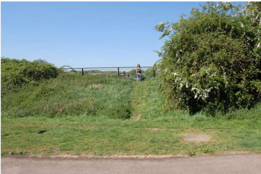
Plate 5. An archaeologist standing on the dam of a medieval fishpond that now forms the eastern boundary of Churchill First School.