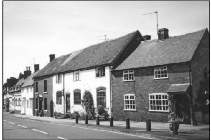
High Street, Feckenham

The village of Feckenham still retains much of its original character. Feckenham was designated as a Conservation Area in 1969 and the Conservation Area was extended in 1995. Given its special character, the Borough Council will require a Design Statement for all new-build residential proposals within the Conservation Area boundary.