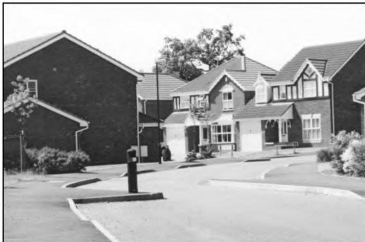
Physical traffic calming measures are part of original design