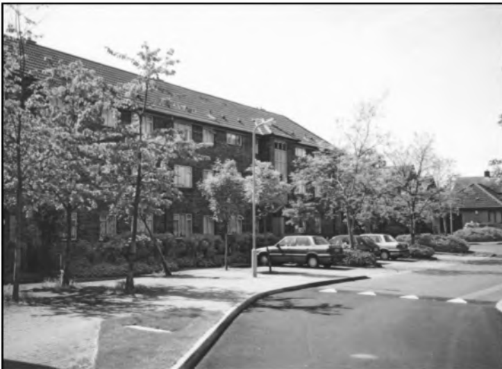
Good natural surveillance of parked cars