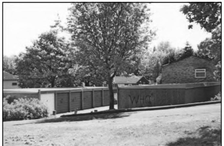
Poor natural surveillance of garage court