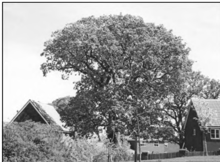
The retention of natural features can enhance the appearance of a new development