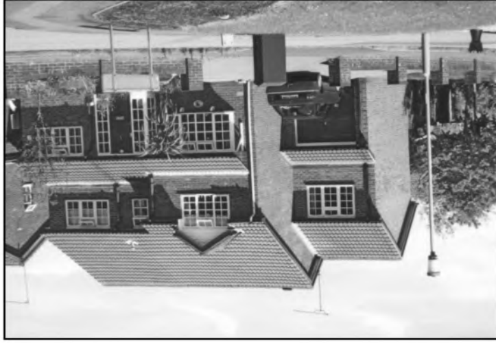
A two storey side extension which is in keeping with the design of the original house