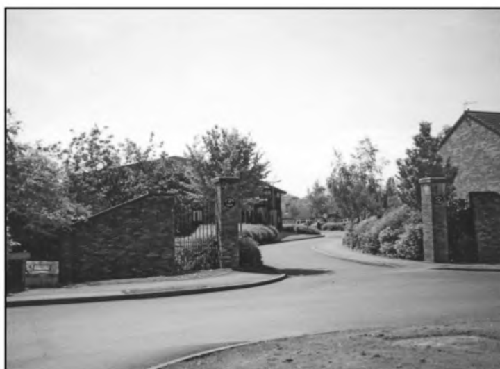
Entrance features reinforce a sense of privacy

Further advice can be sought from the West Mercia Constabulary Crime Risk Manager, Development Control Officers or from the good practice guides listed later in this SPG.