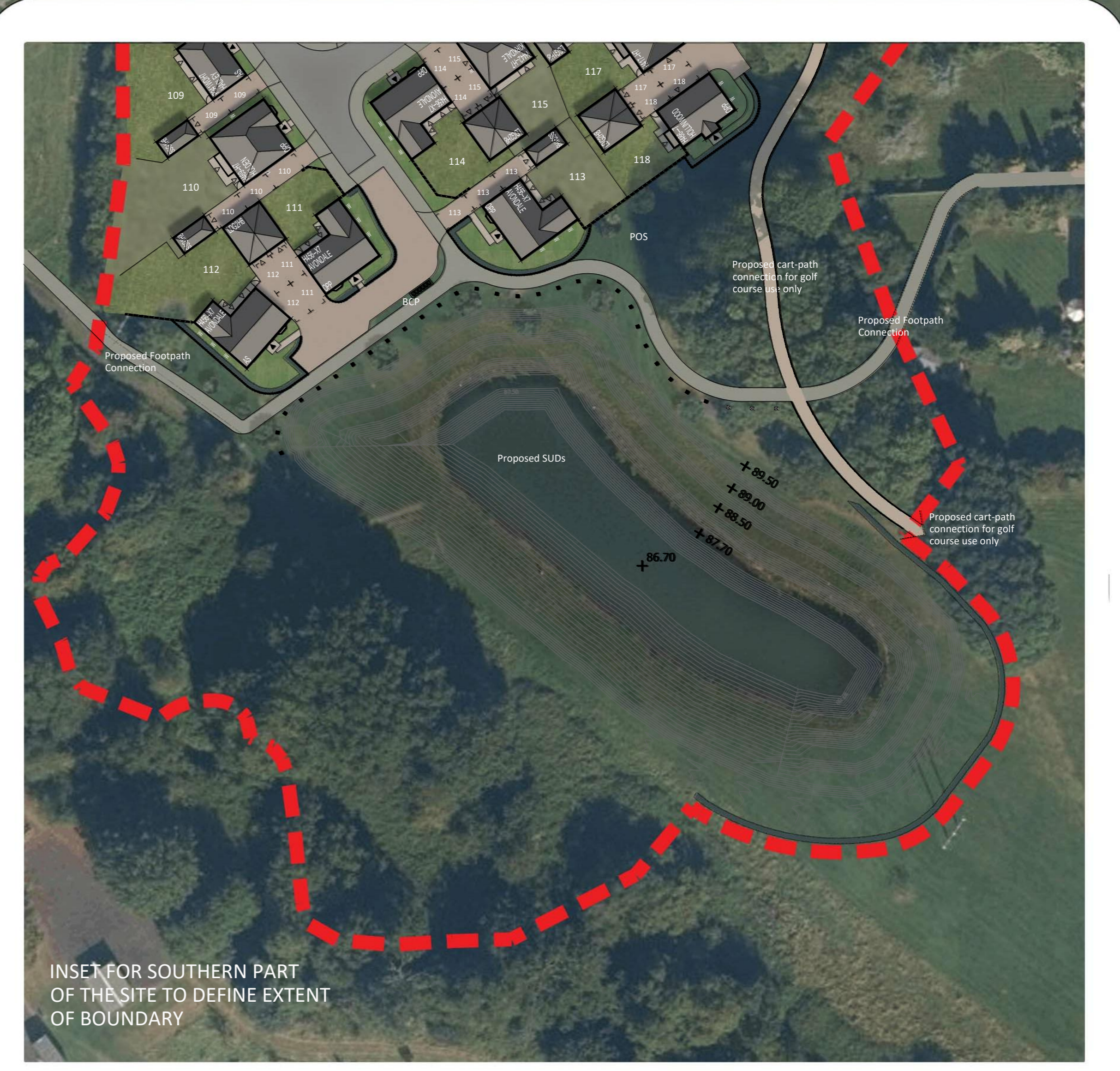
INSET FOR SOUTHERN PART OF THE SITE TO DEFINE EXTENT OF BOUNDARY