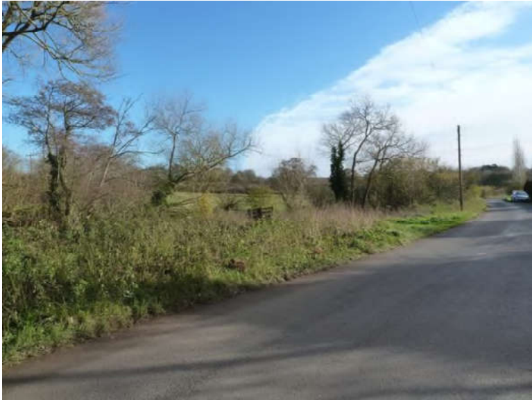
Photo 6, View from Lanehouse Farm to the east