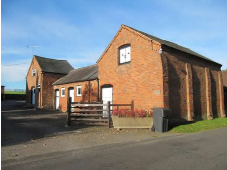
Photo 3, Barns at Lanehouse Farm