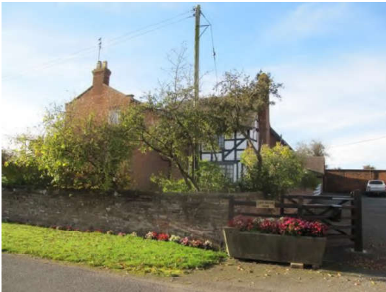
Photo 2, Lanehouse Farm