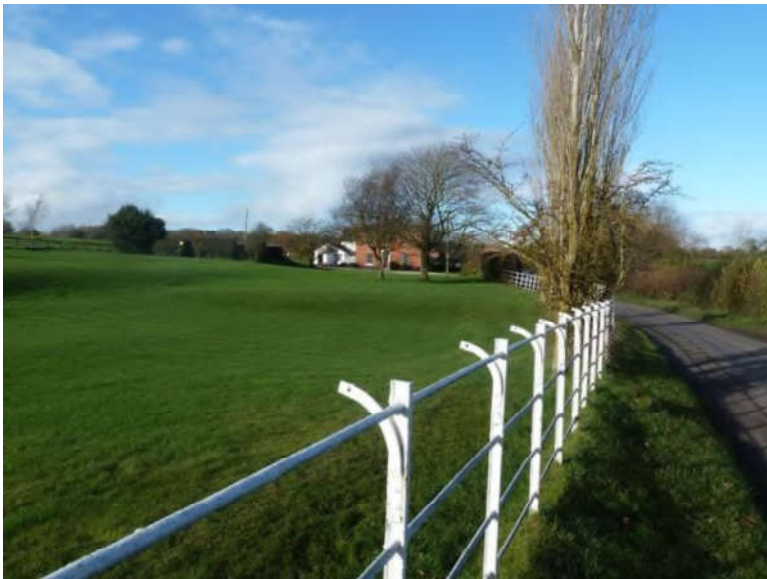
Photo 5, View of Lanehouse Farm from Curr Lane