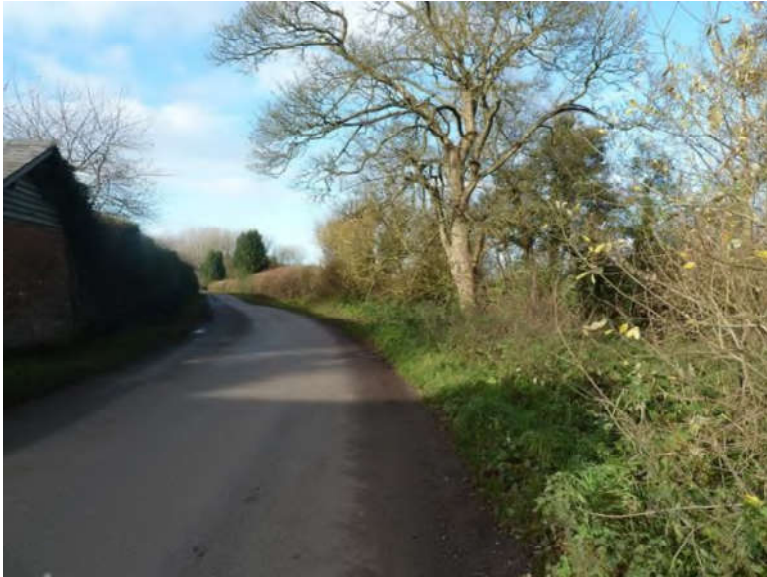
Photo 14, View from Curr Lane adjacent to Lanehouse Farm, to the northwest