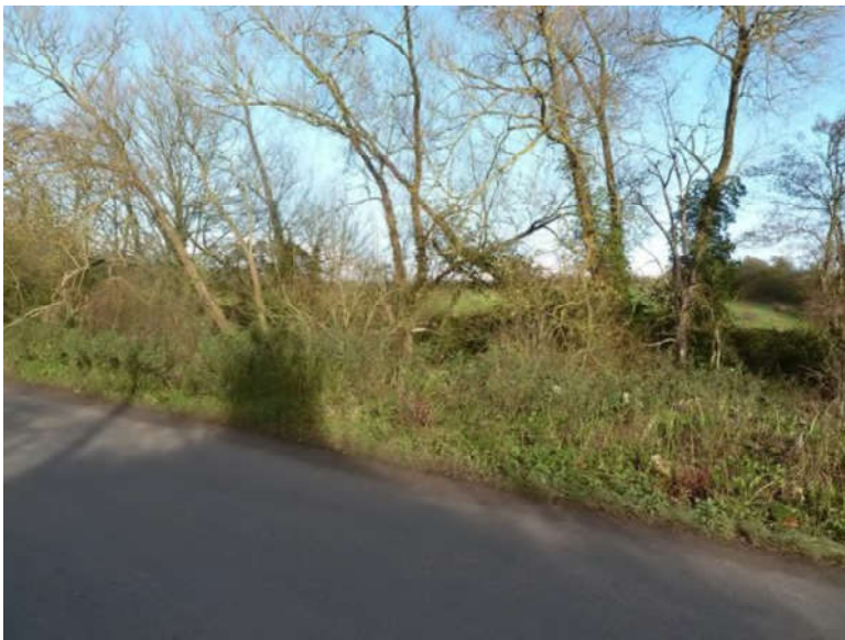
Photo 13, View from Lanehouse Farm gateway to the north