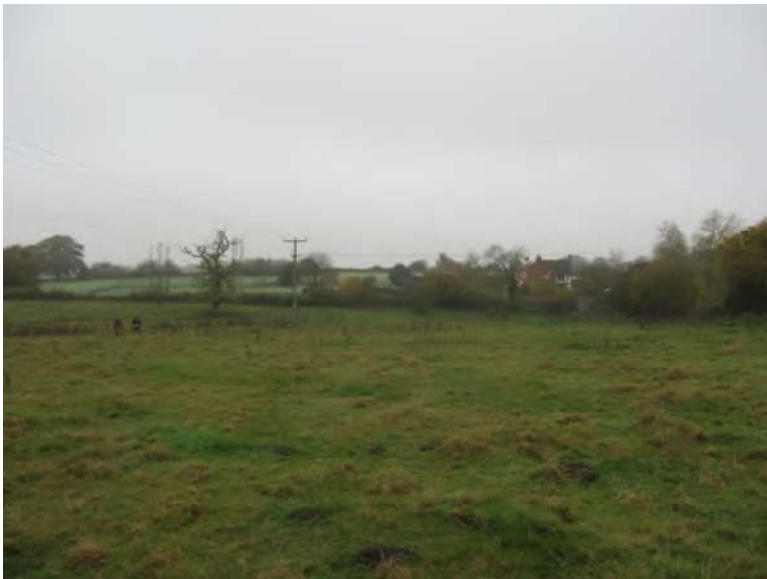
Photo 9, View from the Area 4 to southwest and Lanehouse Farm