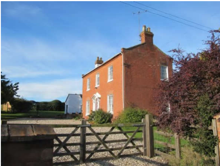
Photo 1, Lanehouse Farm