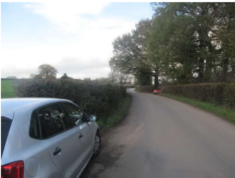
Photo 11, View of Lanehouse Farm from Curr Lane at the junction with the Monarch's Way (PROW)