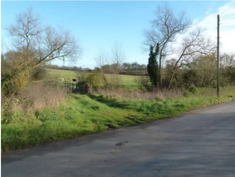
Photo 12, View from Lanehouse Farm to the northeast