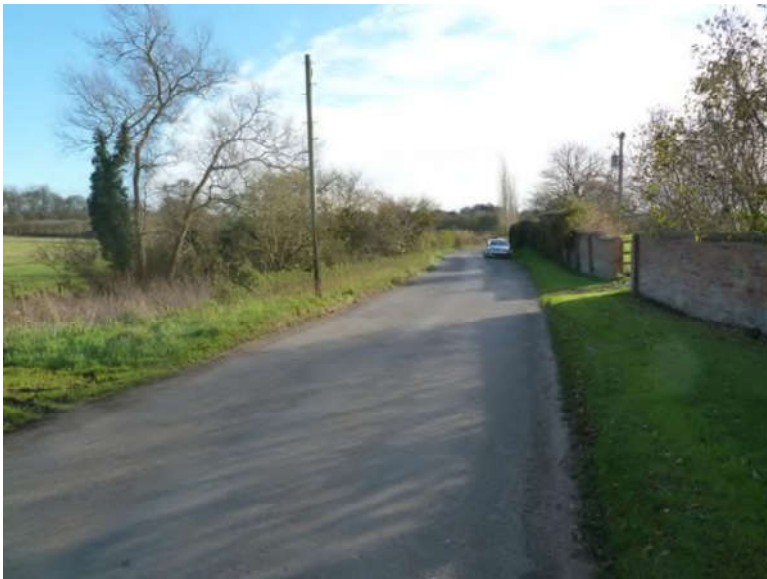
Photo 7, View from Lanehouse Farm to the southeast, along Curr Lane