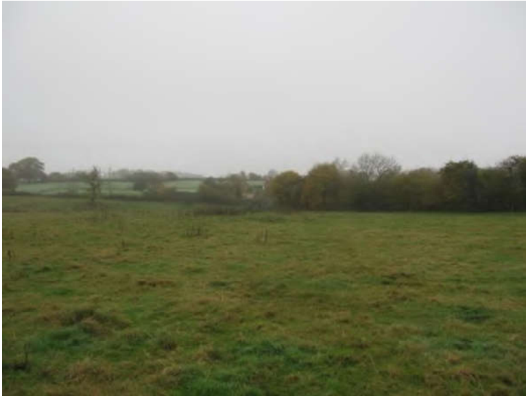
Photo 8, View from the Area 4 to southwest and Lanehouse Farm