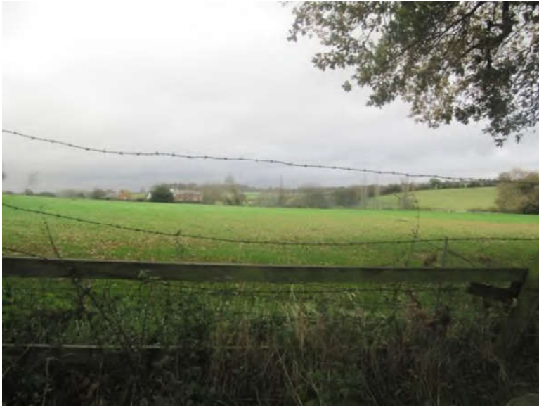
Photo 10, View of Lanehouse Farm from the south